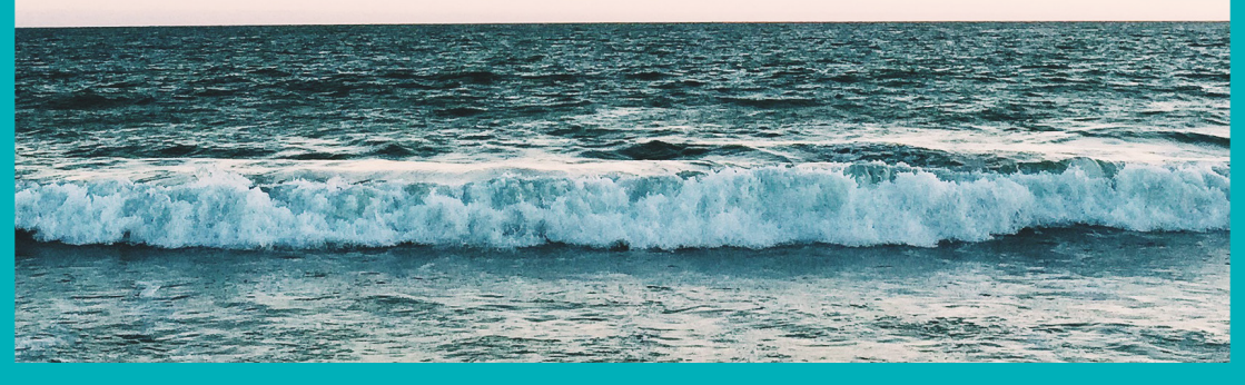
OceanWeb Ltd is registered in the Isle of Man \cdot Company Number: 096177C